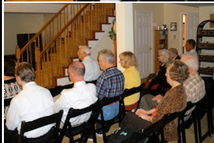
Members Enjoy Annual Meeting Concert