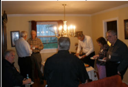
Annual Meeting Social Time